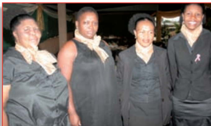
At your service - municipal staff happy to serve.