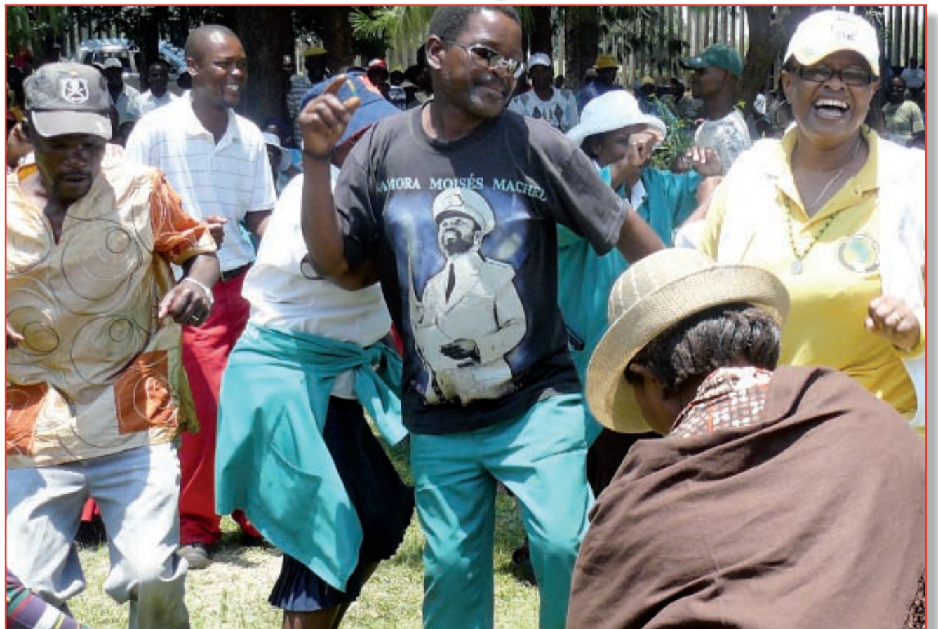
Steve Tshwete Local Municipality held its year-end bash for employees in December 2008. See photo posters on notice boards at the municipality.