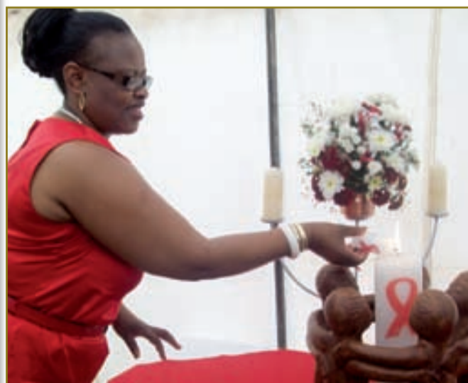
The Executive Mayor, Mantlhakeng Mahlangu lights a candle in remembrance of HIV and AIDS victims.

The Mayor joined this marshalling of the forces