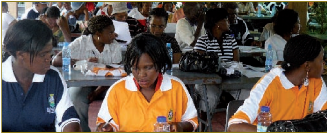
Newly elected Ward Committee Members take note of important points concerning their tasks.

Ward Committee Members are being elected as one of the mechanisms to provide effect to public participation processes as contained in Chapter 4 of the Municipal Systems Act, (Act 32 of 2000). In Steve Tshwete, as in other municipalities, Ward Committee meetings are also convened for this purpose.