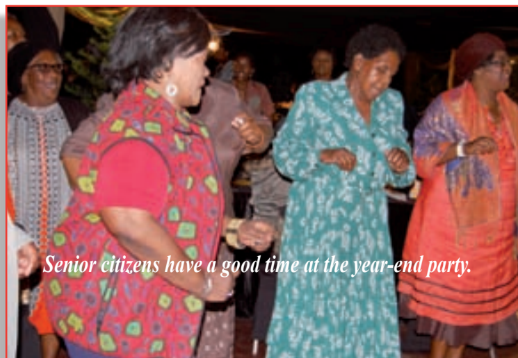
Senior citizens have a good time at the year-end party.