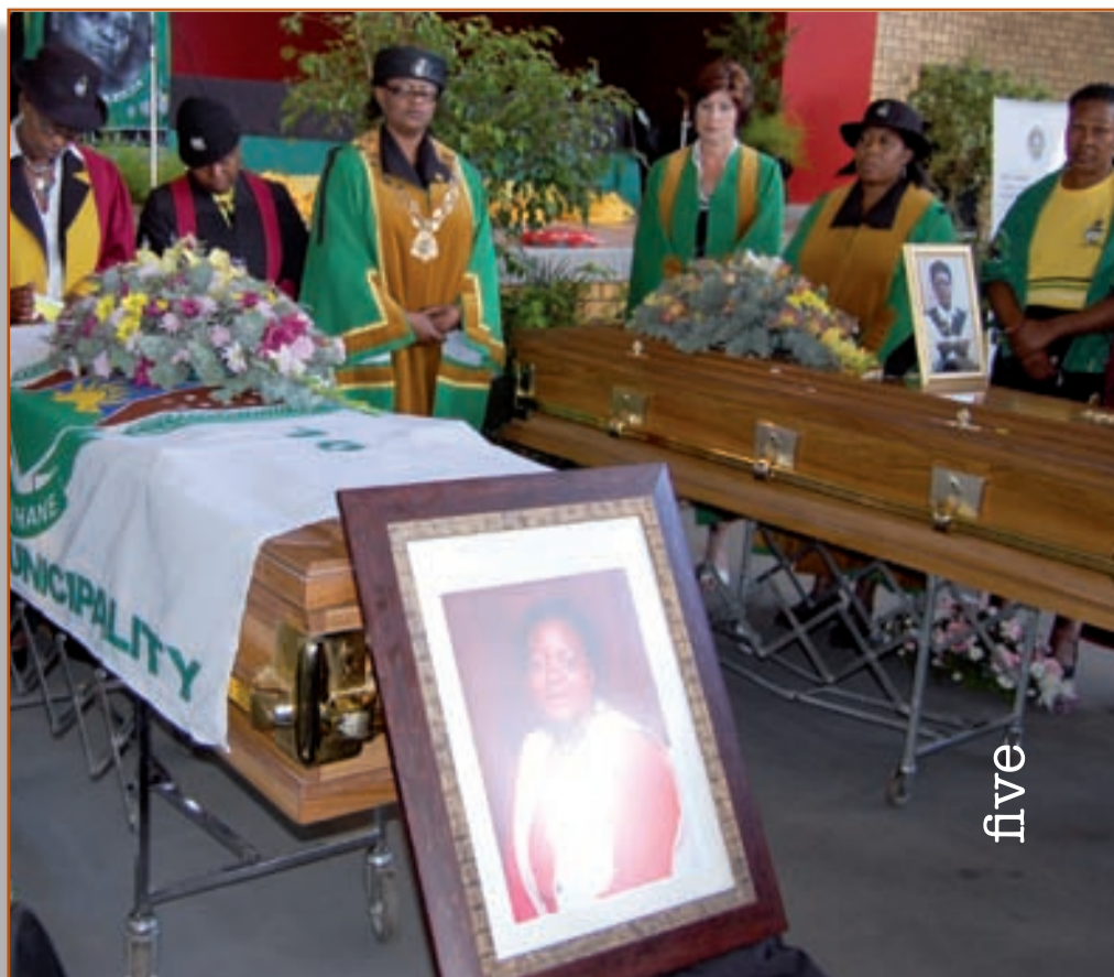
Below: The Executive Mayor, Mantlhakeng Mahlangu and members of the Mayoral Committee pay their last respects.