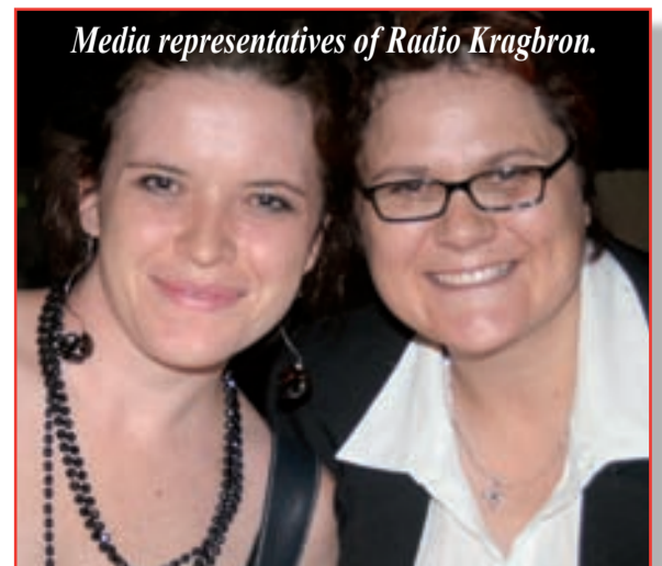
Media representatives of Radio Kragbron.