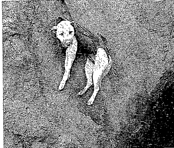
Die hond word uit die mynsgag gehys.